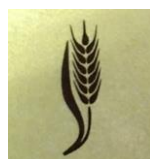
Scientific and Production Association "Energy-Saving Technologies" (Khorostkiv, Ukraine)