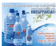
Batig LTD Mineral Water "Novozbruchanska" (Husyatyn, Ukraine)