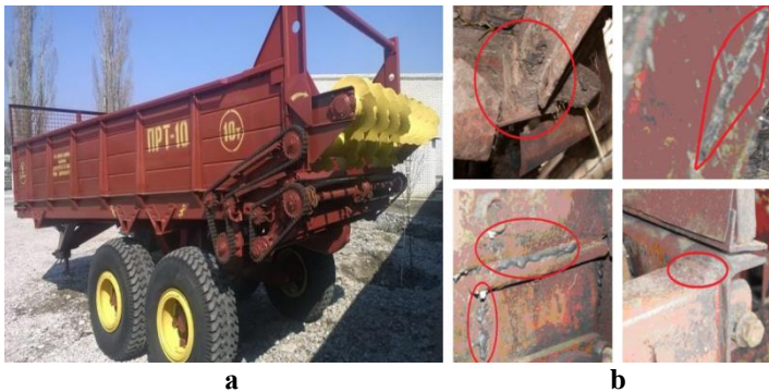
Figure 1. Main view of solid organic fertilizer distributor (a) and a place of cracks formation (b) taking place at maximal loading and moving on rough ground

Some critical loads are taking place while a solid fertilizer loaded distributor is in operation and it is moving on the rough field surface with maximum translatory velocity causing fracture (cracks formation) of the bearing frame structure which is shown on Figure 1.