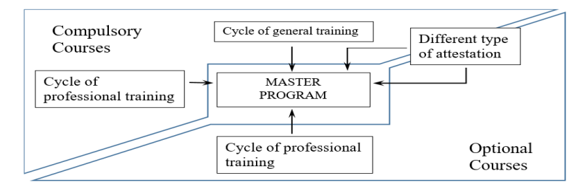
Figure 14.1. Structure of the educational process for the Master's training (education-scientific programme for 133 "Industrial machinery engineering" specialty)

The focus is on professional training which includes both theoretical and practical training in general academic disciplines and professional oriented ones. Such a structure is presented in Figure 14.1.