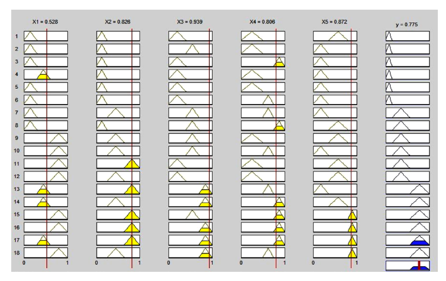
Fig. 3. Visualization of the model defuzzification for determining the level of development of the mechanical engineering industry in the near future implemented in the Matlab software environment

eters can be implemented in trapezoidal, Gaussian and other forms of presentation.